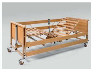
Mattress base with metal slats, manually adjustable lower leg rest