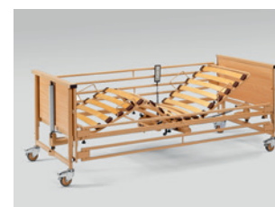
Dali II with metal safety sides (model 15.0624.11)