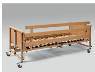
Add-on safety side bar