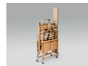
Designed for space-saving transportation and storage