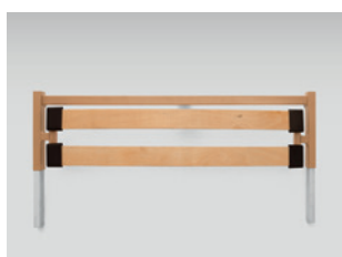
Bed extension including safety side bars (also for retrofit)