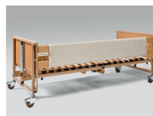
Foam leather cover