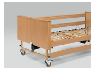
Wooden panels to cover the chassis (also for retrofit*)