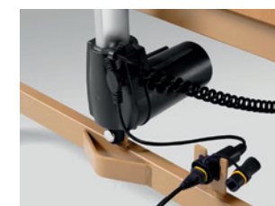
Power socket for connecting the electrical power supply unit (switch mode)