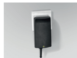
Electronic switch mode power supply unit integrated immediately downstream of the mains plug