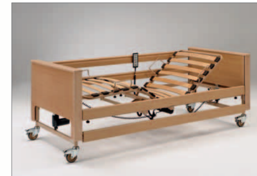
lower leg rest liftable by ratchet