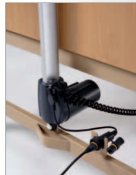
adaptor bushing of the plug for the connection of the electronic switch mode power supply unit