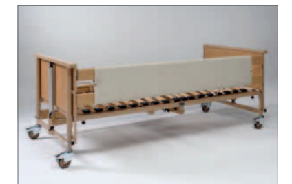
padded side rail cover