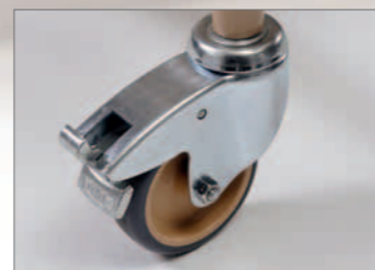
high-quality and robust castor TENTE