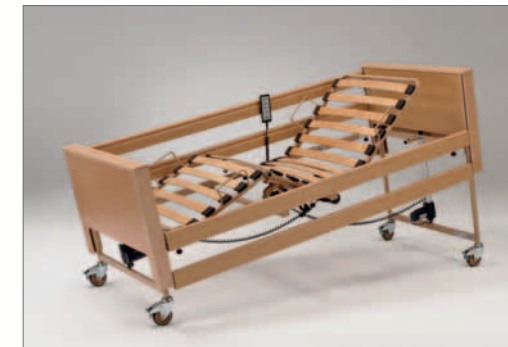
lowered foot section