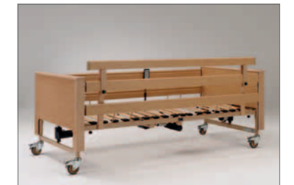
clamp-on extra-high side rail