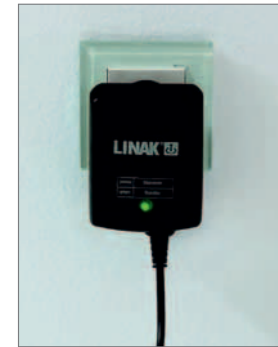
electronic switch mode power supply unit, directly integrated behind power plug (24-volt drive system)