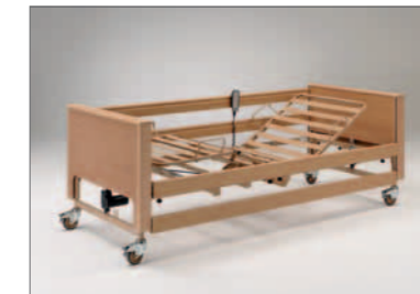
mattress base with metal slats