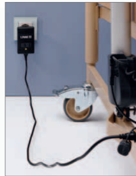
24-volt drive system optionally available