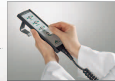
hand control with selective locking function